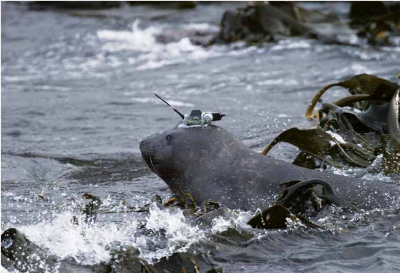
Tagged marine mammals collect data on ocean-atmosphere and physical environment, as well as the ecosystem functioning and dynamics, critical for ecosystem-based management.