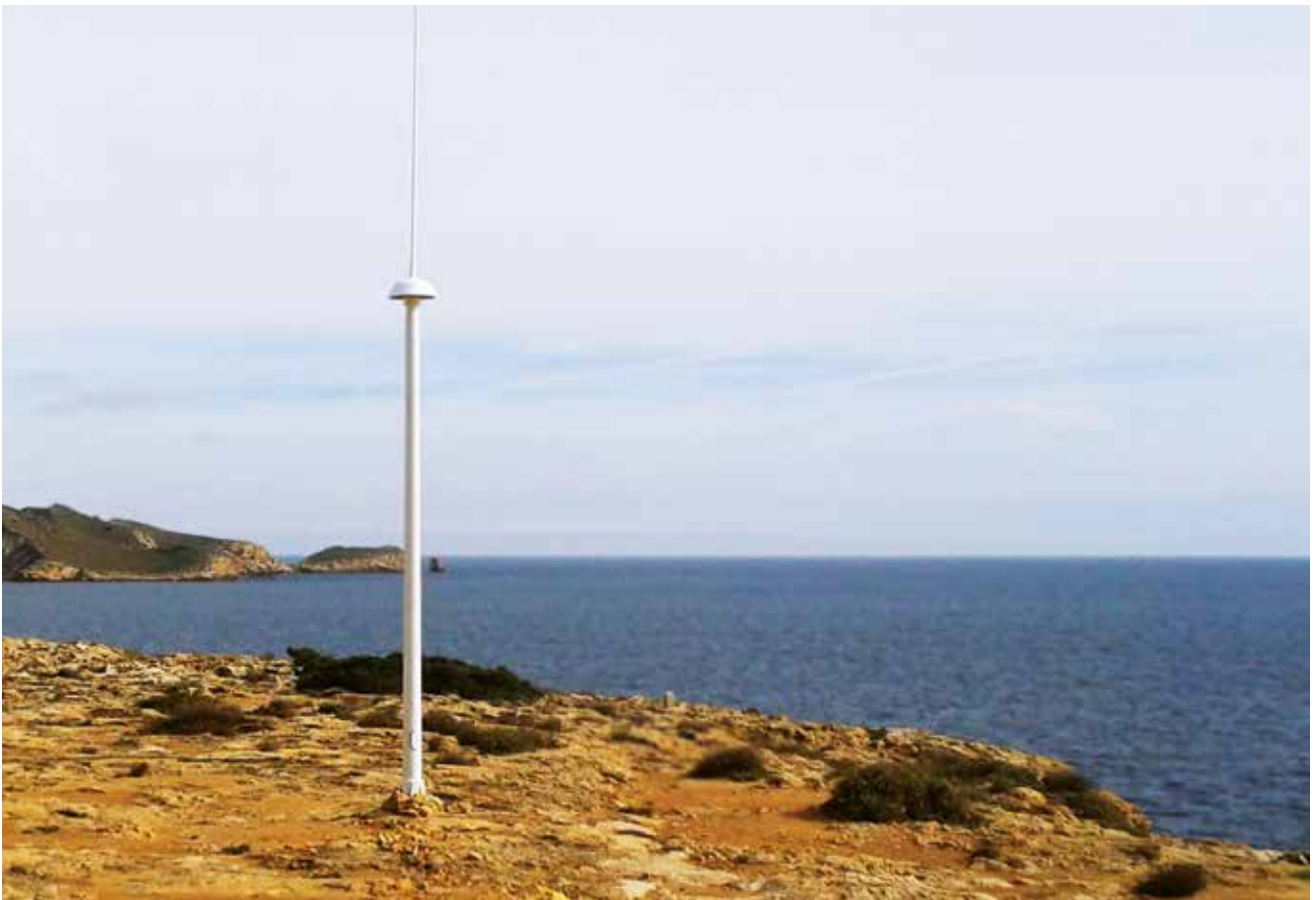
High Frequency radars collect real-time data on surface currents and waves