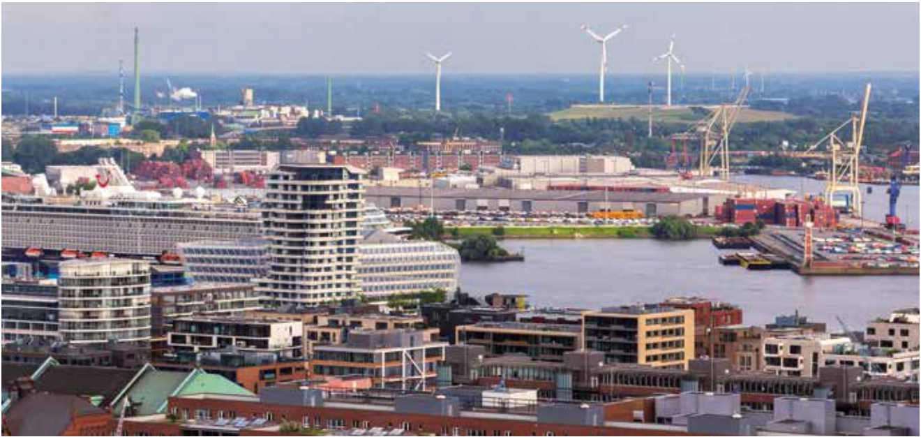
The port of Hamburg, a living example of multi-sectoral economic activities contributing to blue growth