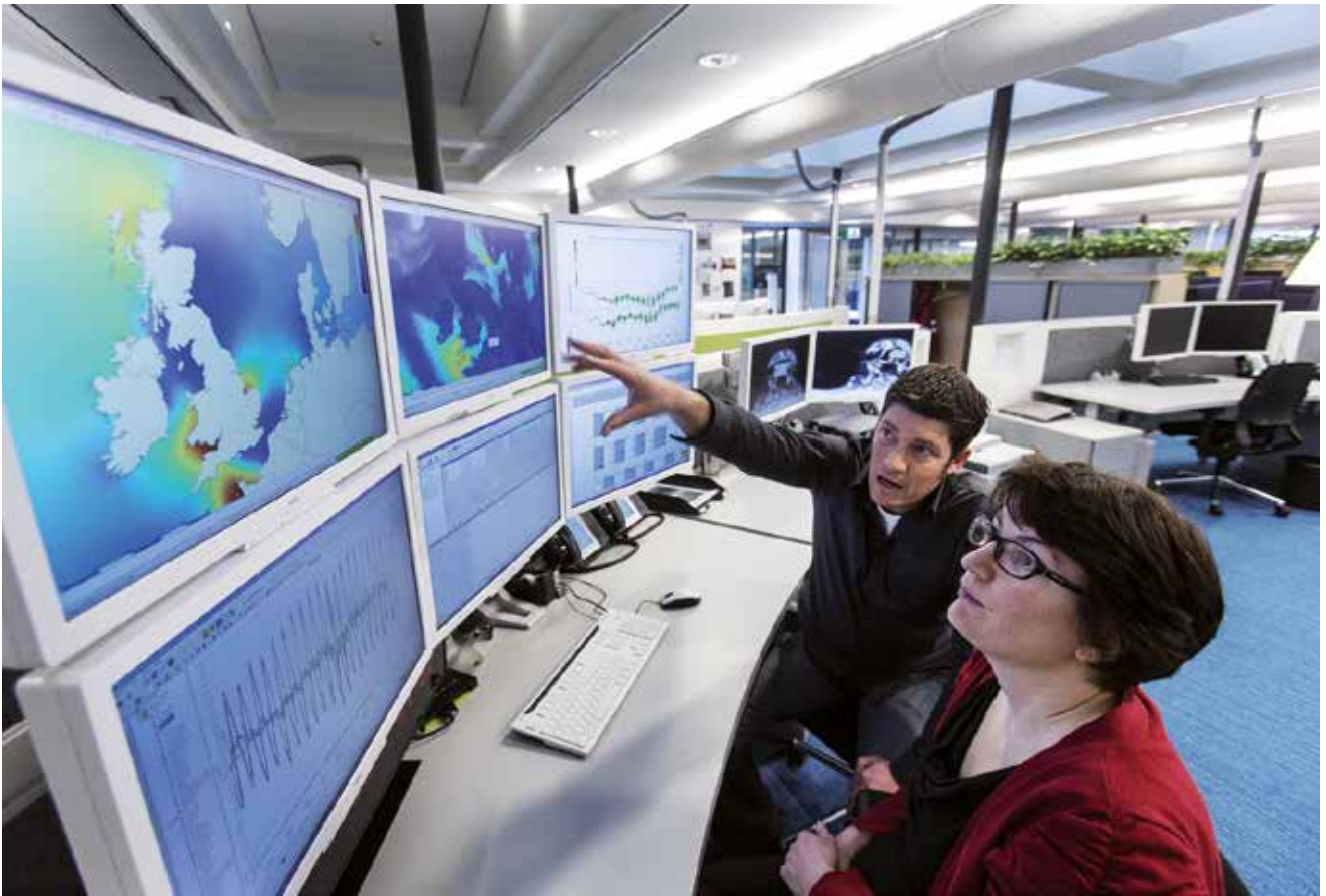
Coastal ocean laboratories, recovering and processing coastal ocean observation data in real time, are key elements to advance science-based coastal management.